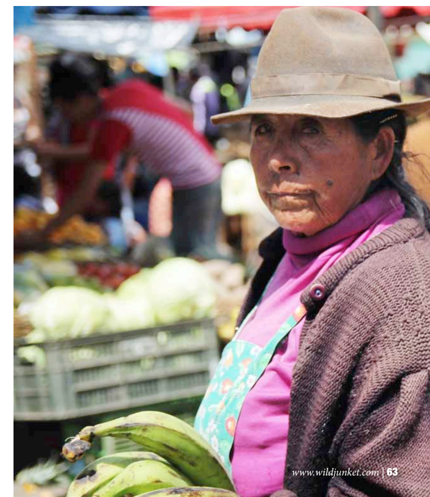
Top row: The old city center of Cartagena is a UNESCO World Heritage site. Bottom left to right: a native of Medellin; beautiful flowers bloom on the streets of Medellin; a Quechua lady in Villa de Leyva.