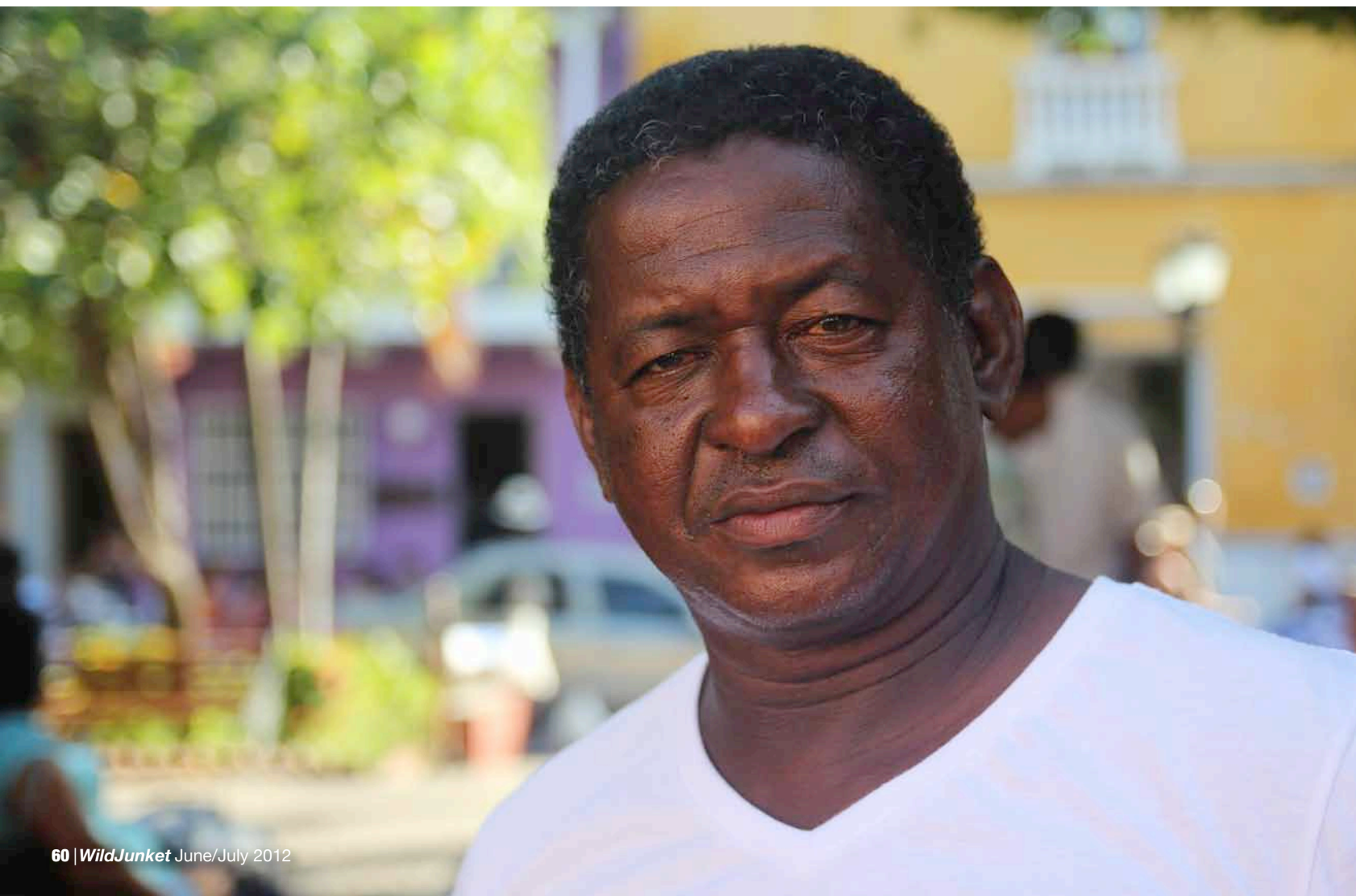
Colonial flavor: The orange walls of Cartagena, a beautiful colonial city. Faces of Colombia (opp page clockwise): An elderly fisherman sits by the port of Cartagena; a smiley police officer patrolling the streets of Villa de Leyva; a local in Bogota.