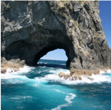
Hole in the Rock, New Zealand