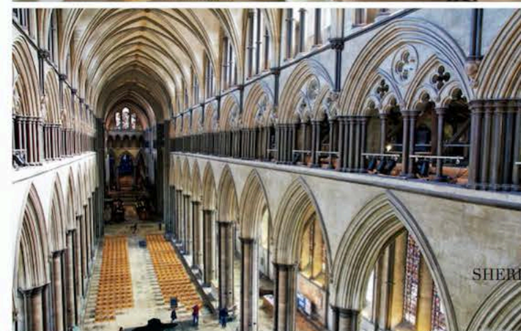
SHERIDAN ROAD 70