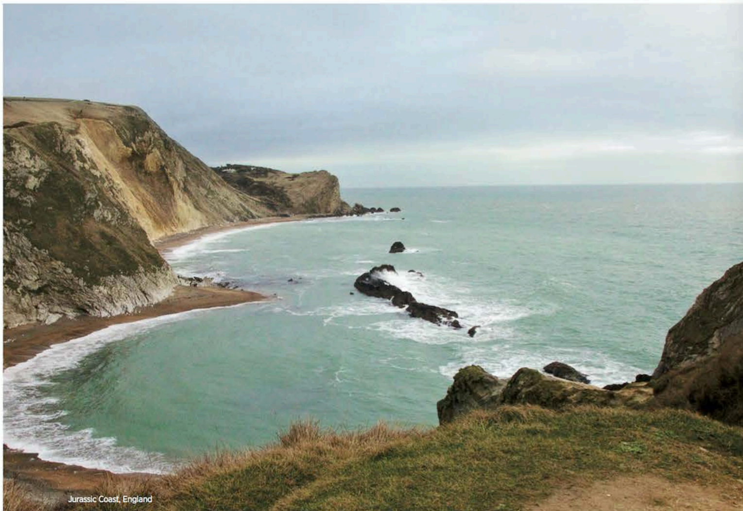
Jurassic Coast, England

FIRST CLASS DINING AND TRAVEL EXPERIENCES