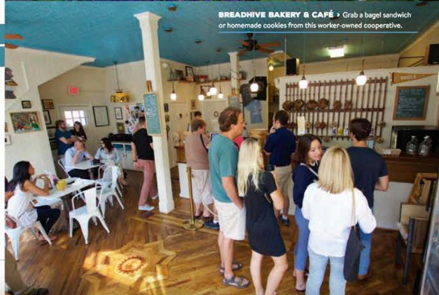
BREADHIVE BAKERY & CAFÉ ▶ Grab a bagel sandwich or homemade cookies from this worker-owned cooperative.

Settling into my room in the historic Hotel Henry that night, I thought about this underrated gem of a city. The sheer number of fun things to do, see, and eat in Buffalo is such a pleasant surprise.