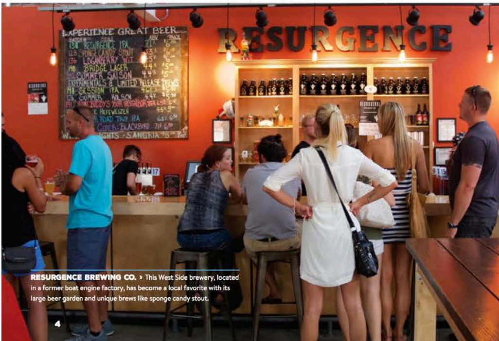
RESURGENCE BREWING CO. ▶ This West Side brewery, located in a former boat engine factory, has become a local favorite with its large beer garden and unique brews like sponge candy stout.