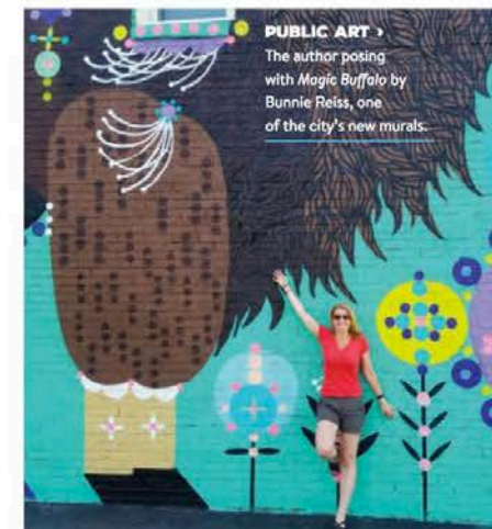
PUBLIC ART ▶ The author posing with Magic Buffalo by Bunnie Reiss, one of the city's new murals.