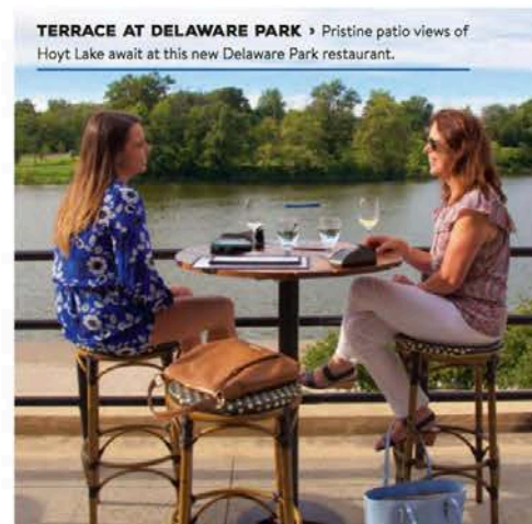
TERRACE AT DELAWARE PARK ▶ Pristine patio views of Hoyt Lake await at this new Delaware Park restaurant.

We rented bikes and jumped on the Queen City Bike Ferry to the far side of the Buffalo River, and were soon on our way riding along a bike path past wooded nature preserves with wild grasses and the glistening waters of